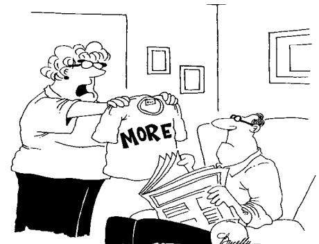
"It's for Thanksgiving. Now, you won't have to talk with your mouth full."